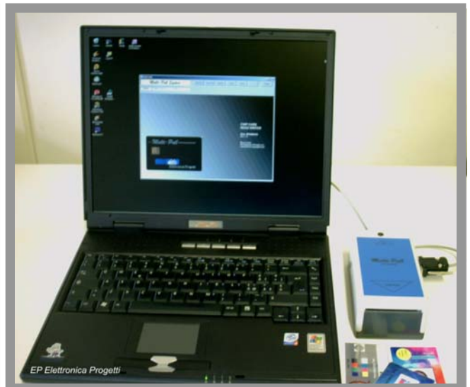
EP096AG3 chip card programmer with his software