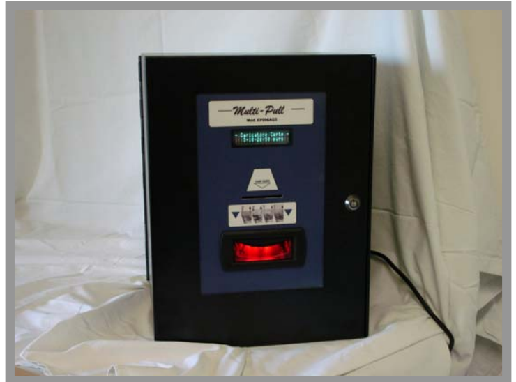
EP096AG5 automatic chip card reload