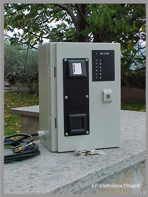
EP096AG1 mechanical coin box