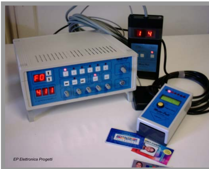
EP095S control unit connected to EP096AG2 chip card access regulating unit